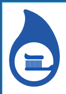
Turn off the Tap and Use a Cup