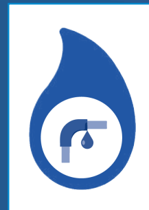
Repair Visible Leaks