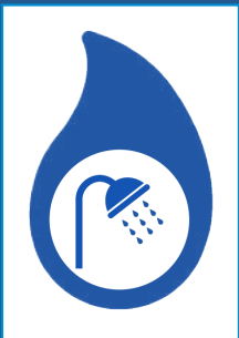
Take Shorter Shower Time