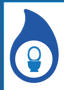
Use Water Efficient Toilet