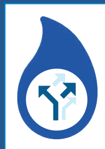
Divert Unused Water