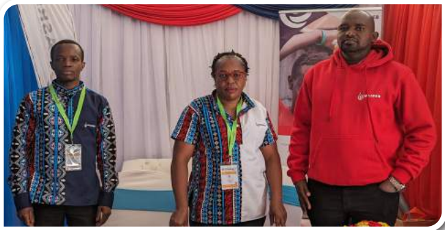
WASREB staff, at the Devolution Conference

“ Ensuring consumers are protected and enjoying their rights to quality water ”