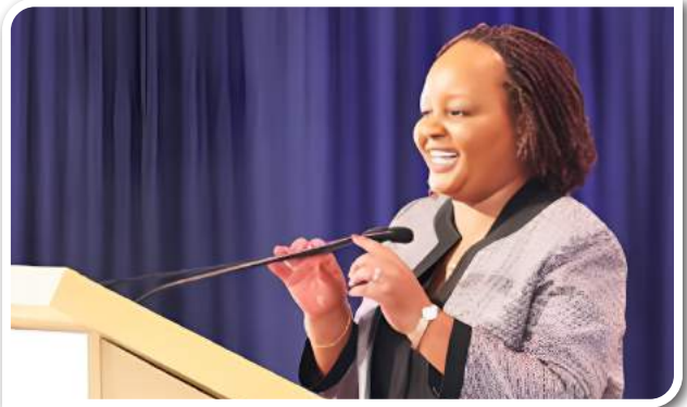
Hon. Ann Waiguru, Chairperson Council of Governors (COG)

“ Ensuring consumers are protected and enjoying their rights to quality water ”