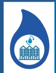
Conserve at Society Level