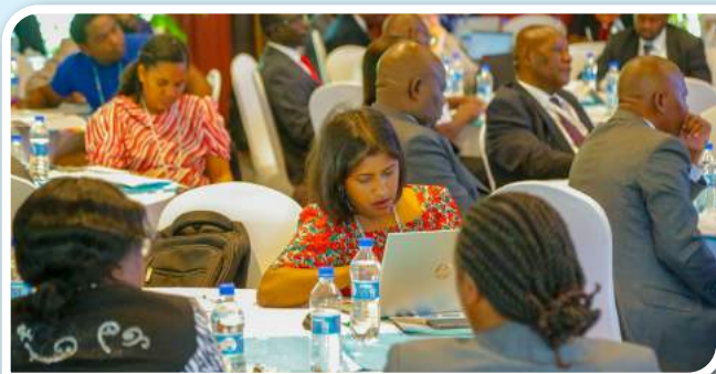
Delegates in attendance at the forum

The forum's expectations is unpacking the role of partnerships in achieving Kenya's water security, the changing water policy and governance landscape for water security in Kenya's drylands, understanding the implications of climate change variability on Kenya's water security.