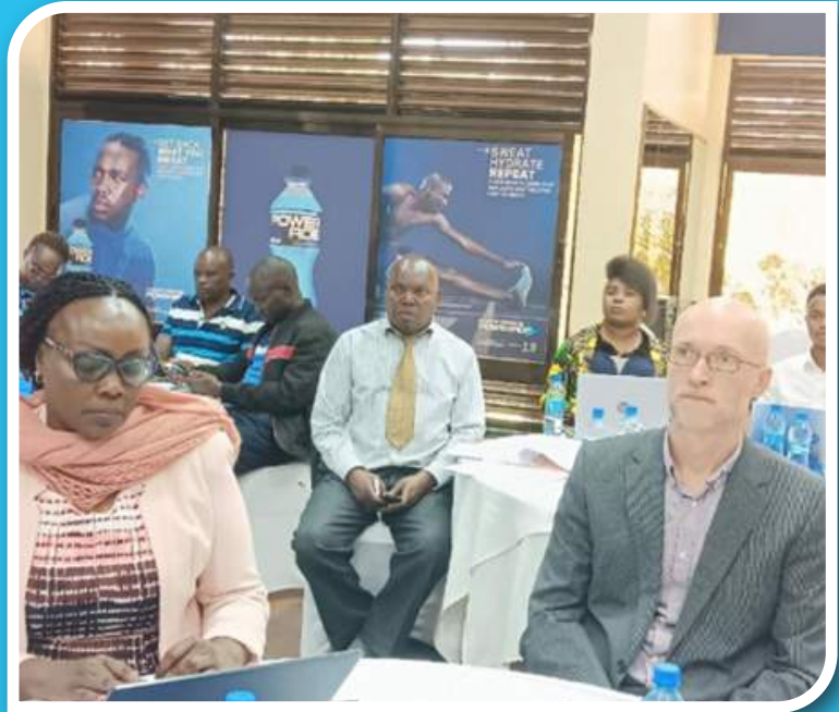
Delegates at the workshop

The participants comprised County Officials, County Secretaries, CEC Water and Environment, Chief Officers and County Directors Water.