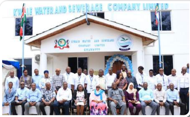
Governor & Kwale Water & County Governments Officials