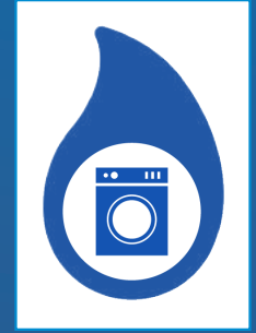
Run Them Fully Loaded