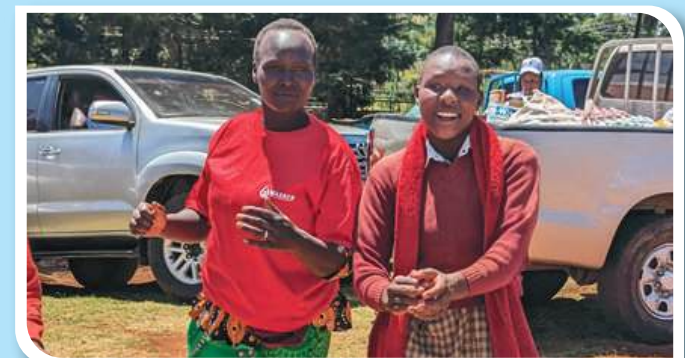
Local residents part of the celebrations