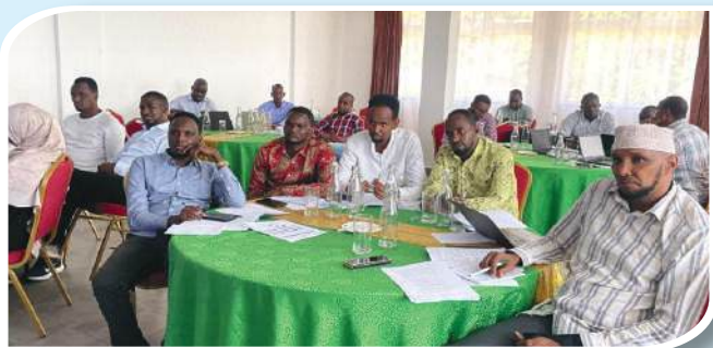
Stakeholders listening keenly