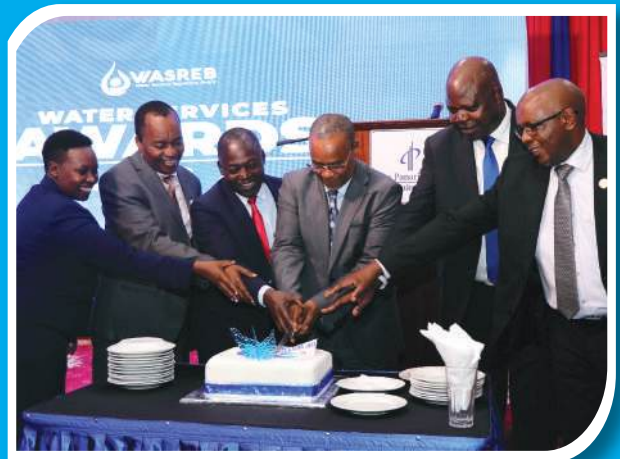
Cake cutting of WASREB's 20th anniversary