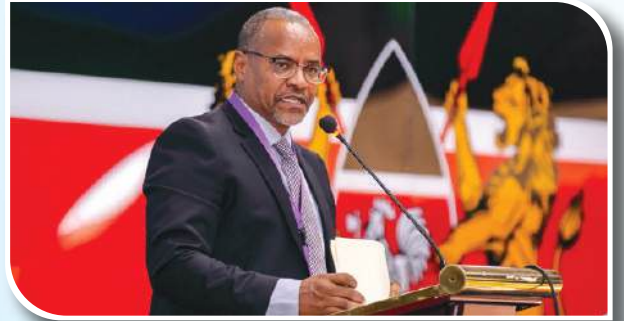
CS Water Hon. Zechariah Njeru giving his opening speech