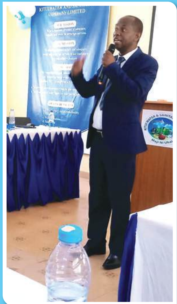
Stakeholders during tariff public consultation meeting