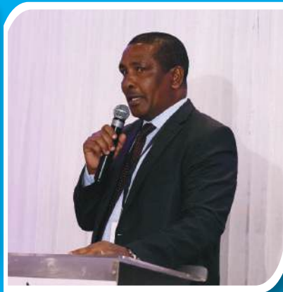
WASREB Director Monitoring and Enforcement giving his remarks