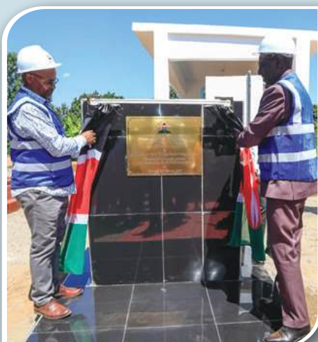
Official commissioning of the project