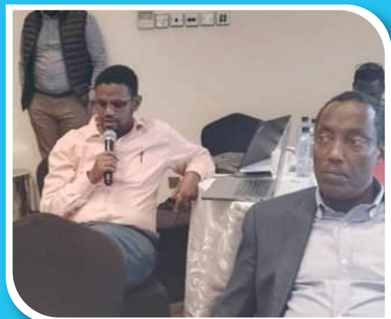
Stakeholders during the workshop