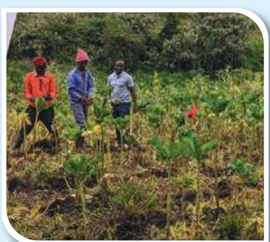
Local residents helping in planting