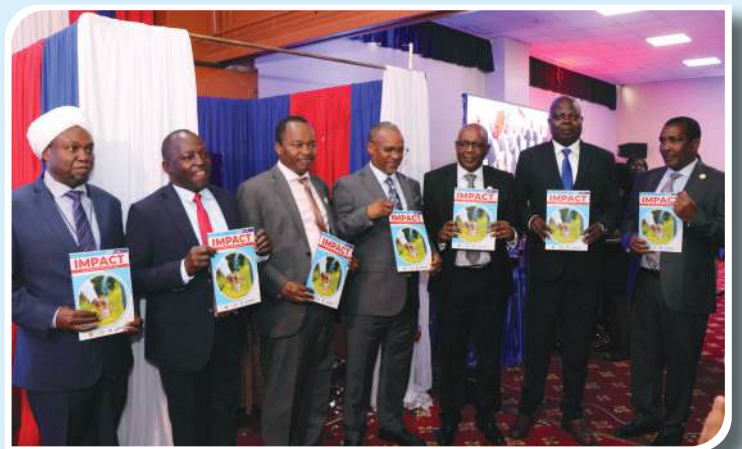
Guests during Impact 16 report launch

All Correspondence should be addressed to the Editor.