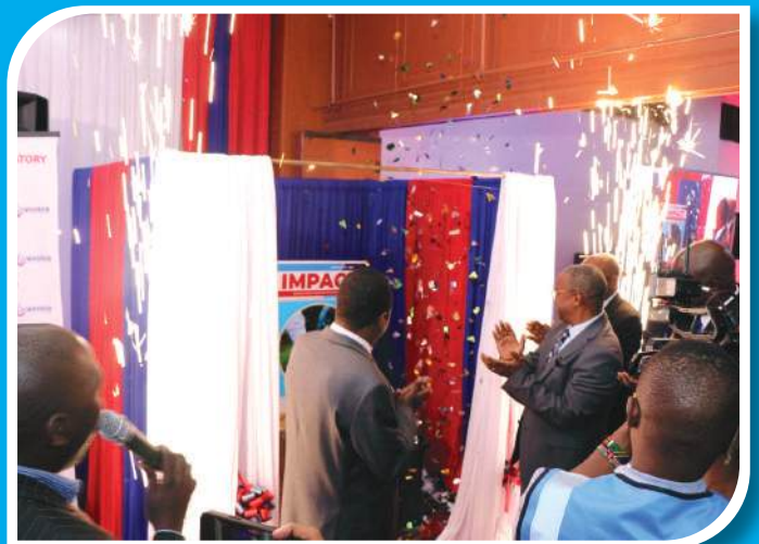
Colourful unveiling of Impact 16 report