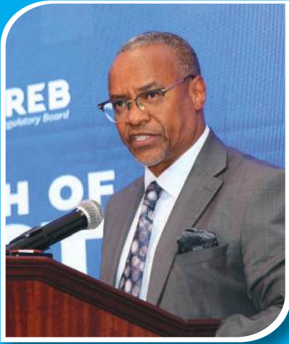
CS Water Hon. Zechariah Njeru giving his remarks