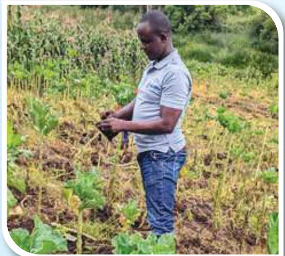
WASREB staff on ground planting tree seedlings