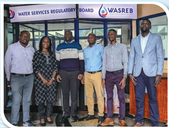
Ministry of Water and Environment, Department of Water Utilities Regulation of Uganda team

WASREB embraces a transformative approach to knowledge sharing and capacity building through a peer learning initiative. Peer learning aims not only to enhance the capacity of water sector professionals but also to foster a collaborative approach to solving water challenges globally. It is also about collectively raising the bar for water service delivery within the water sector. On the 24th of May 2024, WASREB was honoured to host a delegation from the Ministry of Water and Environment, Department of Water Utilities Regulation of Uganda for a 2-day learning visit. The purpose of the visit was to learn how WASREB has successfully integrated ICT systems in water services. The WASREB team provided insights into WASREB's mandate, legal and institutional framework, role, regulatory tools, regulatory data, sector performance, and other relevant aspects.