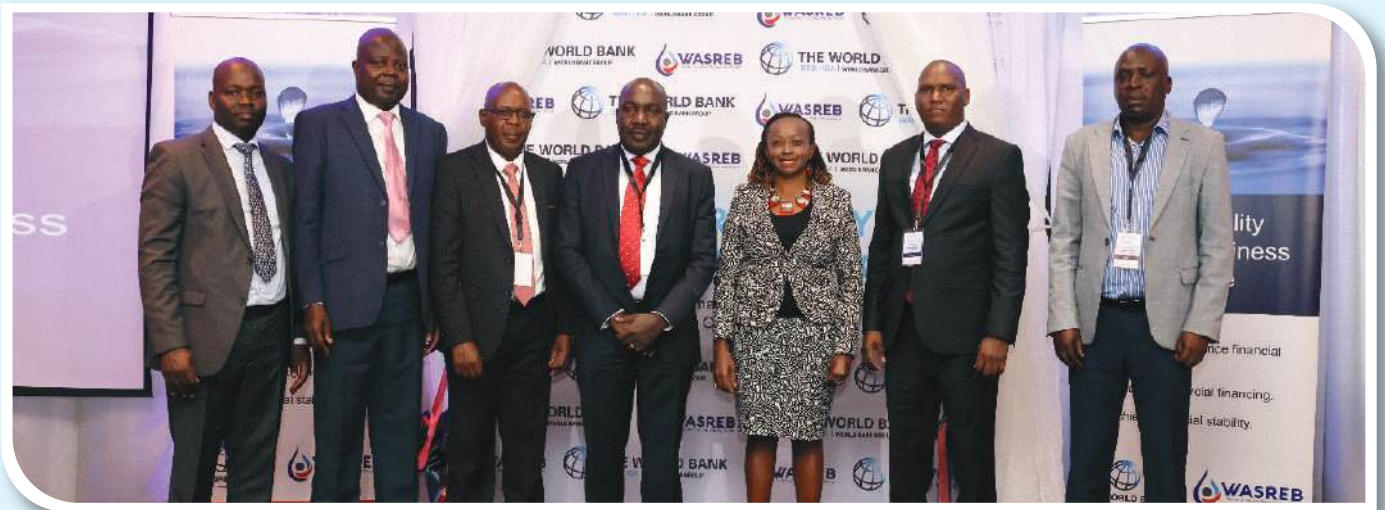
Group photo of the guests after the unveiling

WASREB, in collaboration with World Bank Kenya, launched 'The Water Utility Creditworthiness Course'. This comprehensive training program ran from April to June 2024. The course was a crucial step towards leveraging external resources for water infrastructure development, and enhance understanding of the importance of creditworthiness, in making utilities bankable. The aim of the training was to impart skills & knowledge to 30 key personnel in the water and sanitation sector in Kenya, equipping them with the expertise to support water utilities to improve their operational and financial performance and to focus on accessing commercial financing.