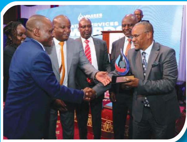
Nyeri Water receiving their trophy