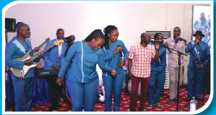
Band entertaining the guests