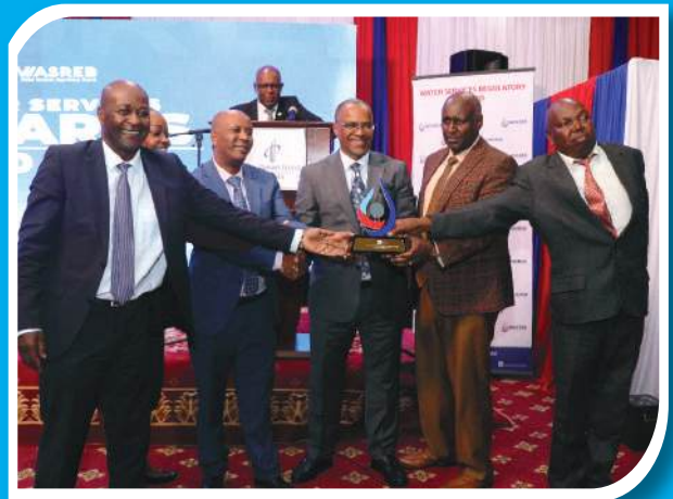
Nakuru Urban Water -Top performer, receiving their trophy