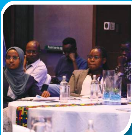
Participants listening keenly