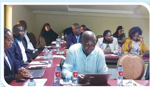
CECMs for Water during the workshop