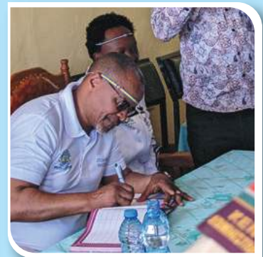
CS Zechariah Njeru signing visitors book at Mindililwo special school