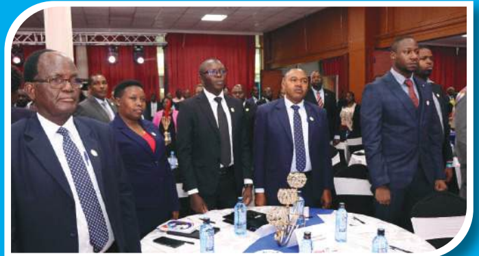
WASREB Board of Directors