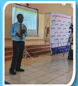
Stakeholders during license renewal public consultation meeting