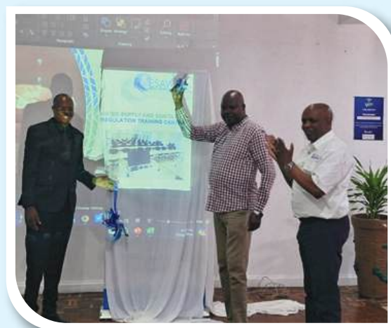
Official launch of WSS training program