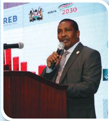
WASREB Director Monitoring & Enforcement highlighting his presentation