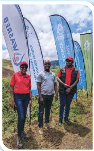
WASREB staff at the tree planting activity